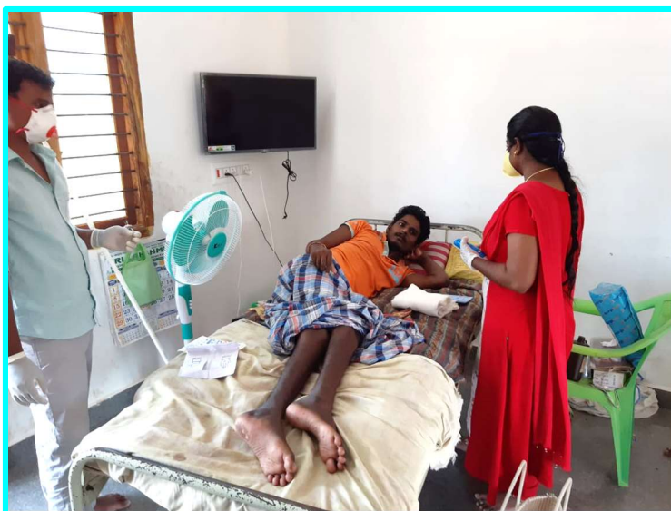
3 Person with severe bed sore receives treatments And Education in Bed sore Management