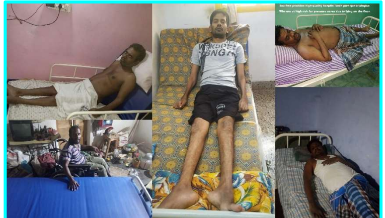
2 Overview of few Hospital Bed Beneficiaries