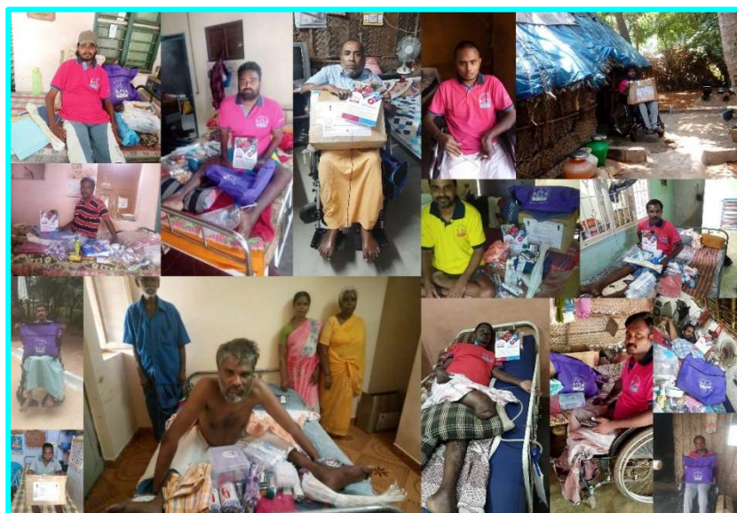
1 Glimpse of few Gift Box Beneficiaries