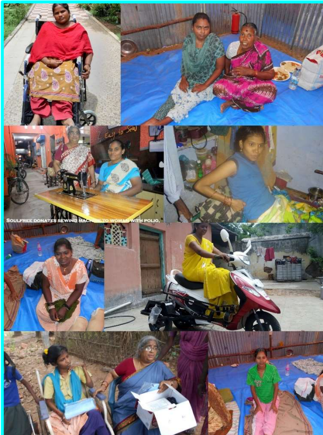
4 Overview of Female Beneficiaries

❁ CAREGIVERS: Initially, several SCIs were struggling because caregivers were