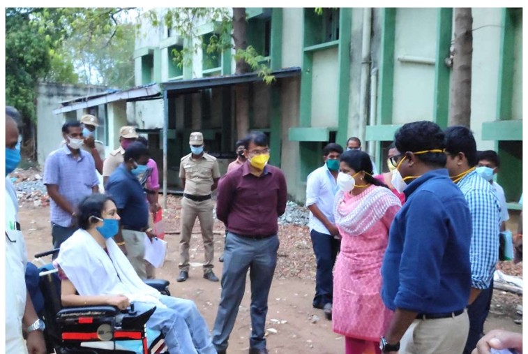
5 Discussion with District Collector And Team Regarding INSPIRE Centre

❁ ECONOMIC PRESSURE: Several charitable organisations have been forced to halt operations or even close down due to the pandemic. However, Soulfree has been blessed with committed and dedicated staff, volunteers and donors and we have been able to continue with great momentum and build on our activities despite the quarantine period.